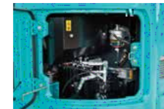
Firewall separates the pump compartment from the engine