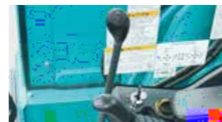
Travel speed select switch The switch is equipped with the dozer lever.