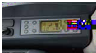
Powerful automatic air conditioner