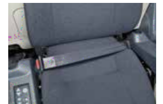
Retractable seatbelt requires no manual adjustment