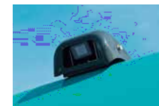
Rear view camera & monitor (optional)