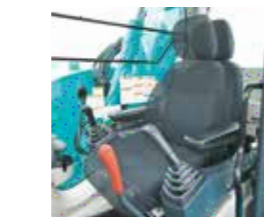
Double slide seat