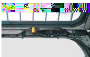
One-touch lock release simplifies opening and closing front window