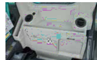
Spacious luggage tray