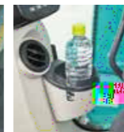
Large cup holder